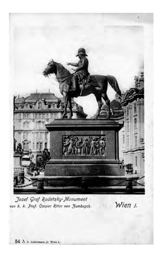
Radetzky's equestrian monument in Vienna