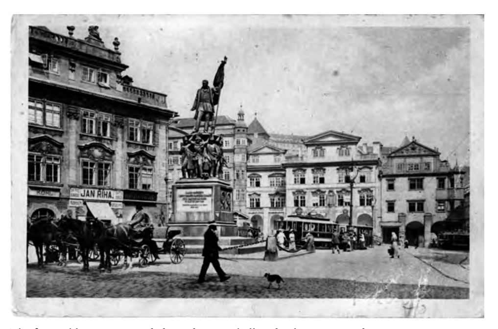
The first public monument dedicated to Marshall Radetzky was erected in Prague in 1858.

Count Radetzky on a trade card for Schichts soap.