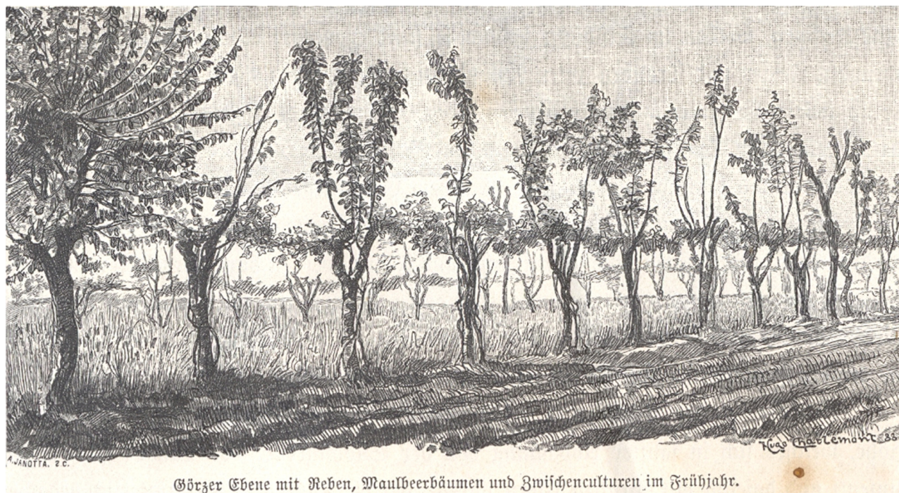
Figure 5: Field with vines, fruit trees and crops.