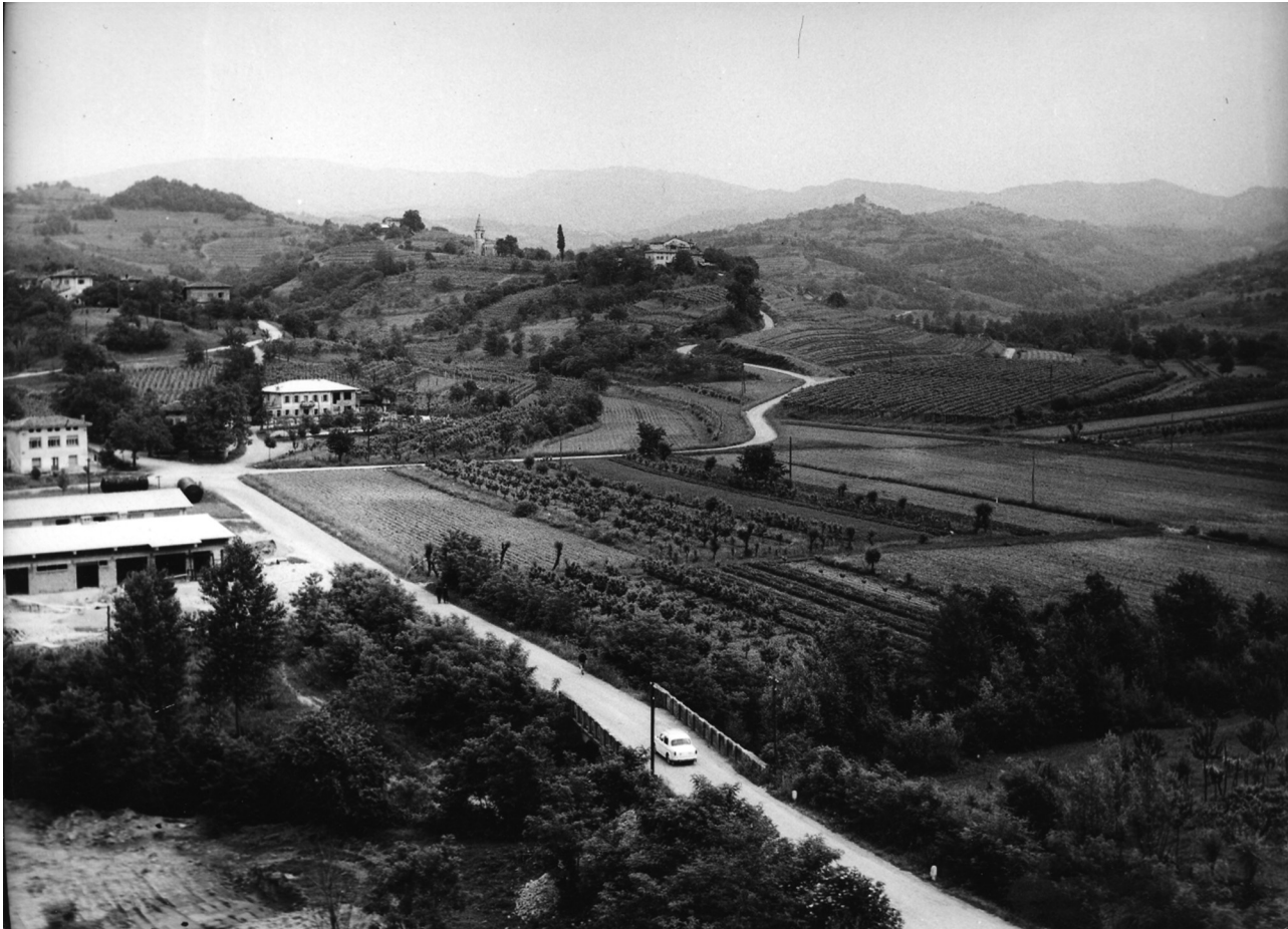
Figure 3: Fields featuring detached plots with vines, crops or fruit trees in 1956 (photo collection Goriški muzej).

the banks were used for fruit trees [37]. The fields were planted with vines, crops or fruit trees (Figure 3). Until more detailed studies have not been undertaken, there was a wide-spread belief that throughout the centuries the cultivation method and crops have not changed, apart from the introduction of corn and potatoes.