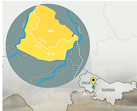
Figure 1: Gorica hills position between the states of Slovenia and Italy (The map is made by the Italian scientific and technical committee (coordinator arch. Elisa Trani) for the WHL UNESCO “Brda Collio Cui Paesaggio culturale Transfrontaliero terrazzato” project and approved by the Slovenian scientific and technical committee).

The Gorica Hills region is predominantly situated in Slovenia with a smaller proportion lying in Italy (Figure 1). As early as the late Middle Ages, a border crossed its western part which divided it up to World War I (WWI) [24]. During the New Ages the Gorica Hills were a border area between the Habsburg Monarchy and the Venetian Republic [25]. The Gorica Hills region belongs to the cultural landscapes of the Mediterranean hills and consists of a soft flysch [26]. It is characterised by an intricate mosaic of forests, agricultural landscape patterns and built-up areas. The area's dramatic terrain makes it even more diverse and different from the agricultural landscapes of the plains and the vast cultivated areas that result from intensive farming [25]. The Gorica Hills have been synonymous for a cultivated hilly landscape since the Middle Ages [26,27]. In fact, the region has been characterised by a mixed cultivation of vineyards, fruit trees and sowing land plots situated on terraces as well as fields. Because of a partially mechanised cultivation, nowadays the cultivated areas situated on hills and in plains are characterised by monoculture, i.e. vines, fruit trees, olive trees and less frequently crops. The mixed cultivational