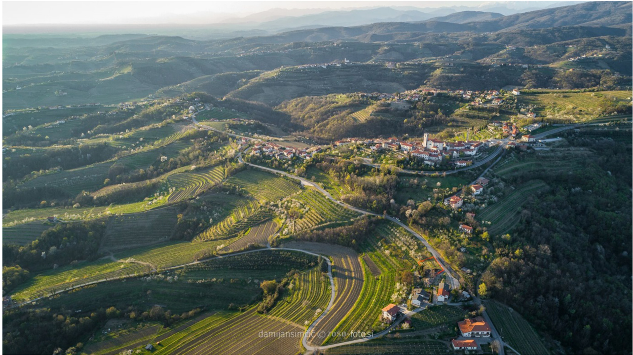
Figure 2: The landscape of Gorica hills today.