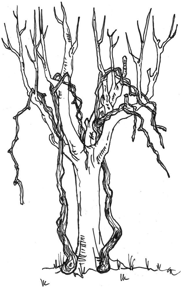
Figure 7: Reconstruction of vine training system in the Gorica Hills in the nineteenth century (author Nataša Gregorič MFA – Master Fine Arts).

machinery after WWII, the plain terrace surfaces were still being used for growing several crops [26]. Once machinery started being used, this space was no longer suitable for this purpose. Fruit trees also hindered the cultivation of vines with machines. As a result, monoculture was introduced, which we define as a vineyard, orchard or olive grove. Nevertheless, despite numerous modern machines, a large proportion of work (pruning, tying, harvesting and fruit picking) is still manual.