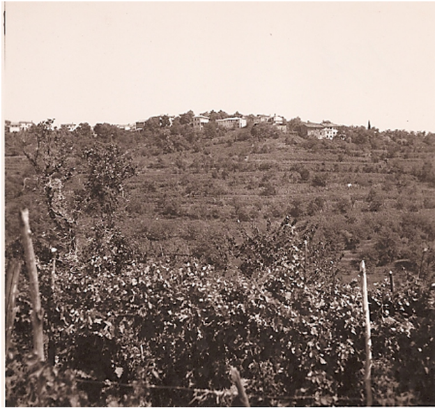
Figure 4: Brajdas featuring mixed cultivation in 1958.

cesto dei medesimi, ma é cosa certa, che se I coloni non ricavarebbero dai terreni tenuti in affitto un discreto profitto dalle frutta, essi già mai potrebbero vivere colloro famiglie. When you listen to all the masters from the Kojško district, the yield of fruit, including cherries, pears, apricots, plums, peaches, figs and chestnuts, it seems insignificant. They claim that they do not grow more than a basket of fruit, but it is certain that the tenants, without a certain fruit product, would not be able to survive.”